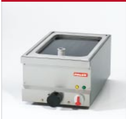
BistroLine Griddle Plate 400 for roasting and grilling