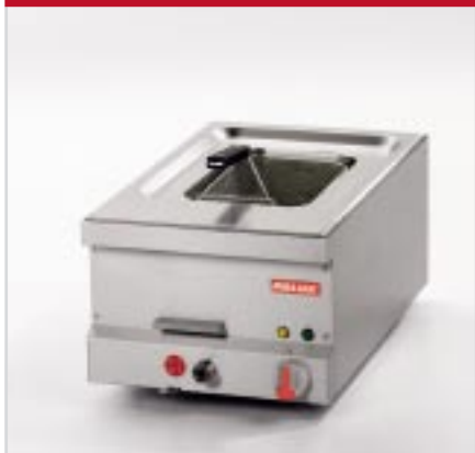
BistroLine Deep Fat Fryer for healthy, low-fat frying