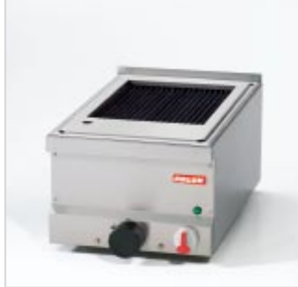
BistroLine Steak Grill 400 for grilling and roasting