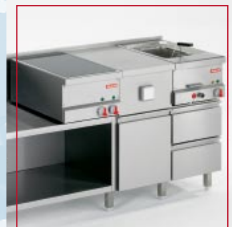
PALUX BistroLine Type 1 – for individual, flexible assembly, according to capacity and current range of meals offered, on closed basements with hygienical cover.