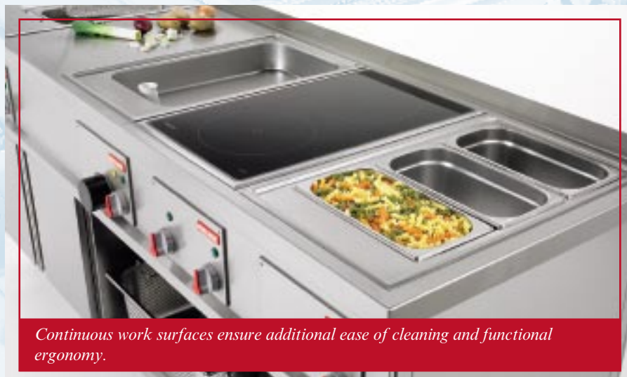
Continuous work surfaces ensure additional ease of cleaning and functional ergonomics.