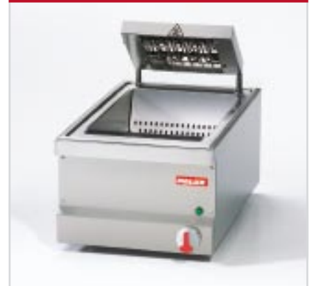
BistroLine Deep Fat Fryer GN 1/1 for keeping deep-fried food hot