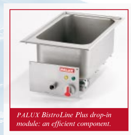
PALUX BistroLine Plus drop-in module: an efficient component.

A practical, modular and variable basement system facilitates perfect combinations to satisfy requirements. The PALUX BistroLine Plus basements , in standard or hygiene version, offer a wide variety of functions in numerous equipment variants. In addition, there are many useful details.