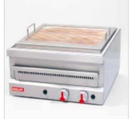
BistroLine Gas Lava Stone Grill for grilling and frying