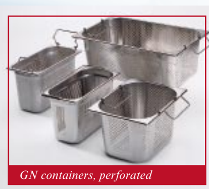
GN containers, perforated