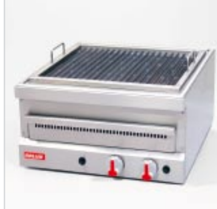
BistroLine Gas Grill for grilling and frying