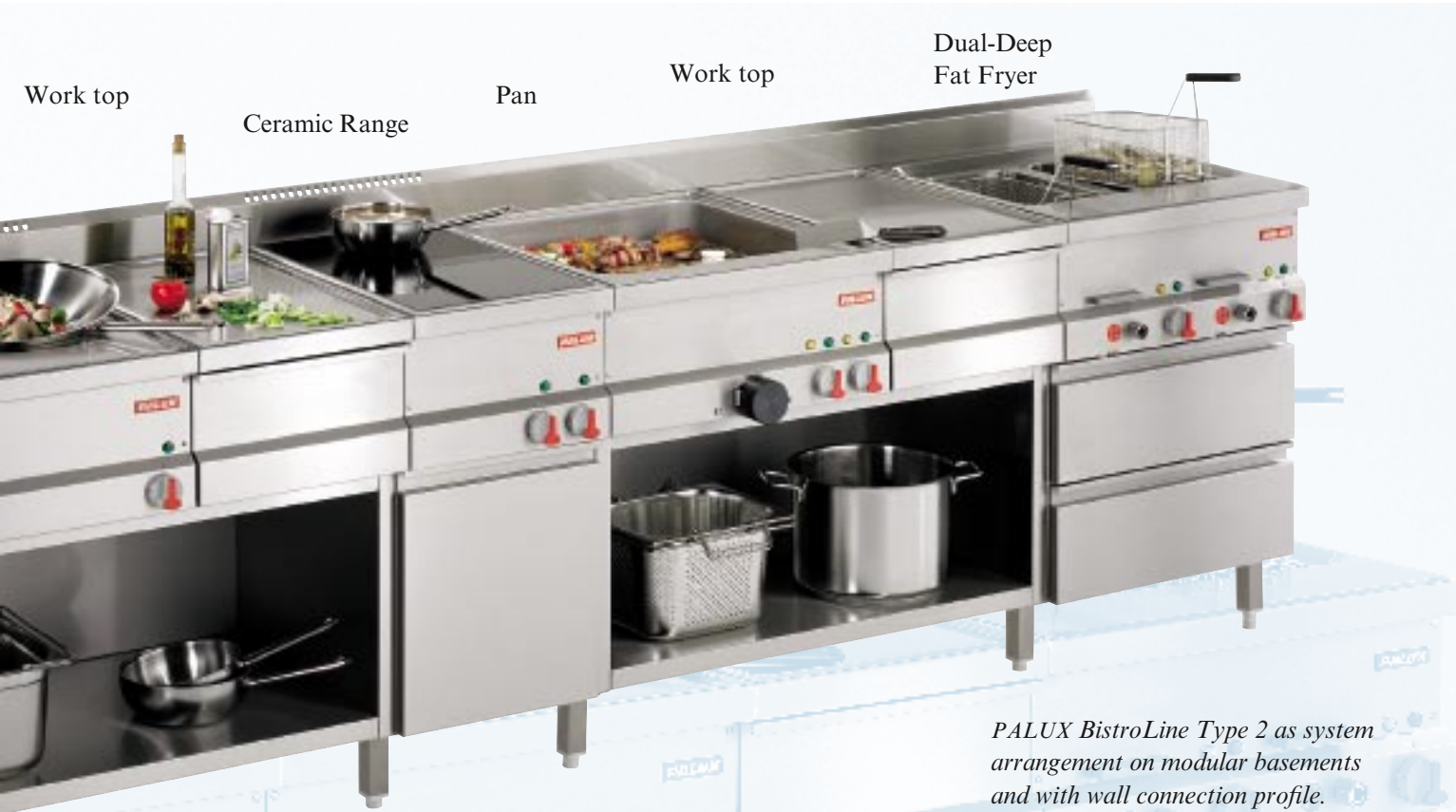
PALUX BistroLine Type 2 as system arrangement on modular basements and with wall connection profile.

... for flexibility and economical efficiency!