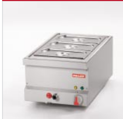
BistroLine Bain-Marie GN 1/1 for keeping food warm gently