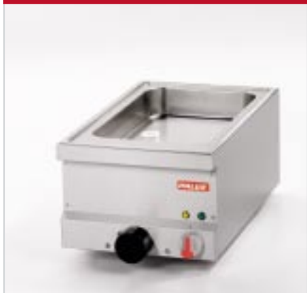
BistroLine Pan 400 Roasting, stewing, steaming, braising