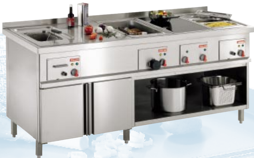
PALUX BistroLine Plus as a drop-in option with continuous work surface on modular basements.

A plus in function, capacity and individuality