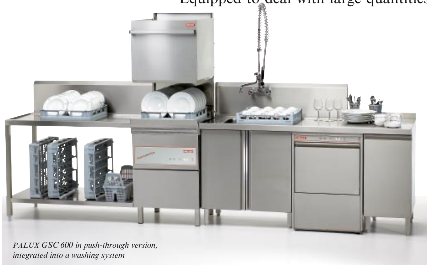
PALUX GSC 600 in push-through version, integrated into a washing system

The PALUX series GSC 600 dishwashing systems form the basis of an economically sensible washing organisation with best washing results.