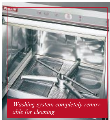
Washing system completely removable for cleaning