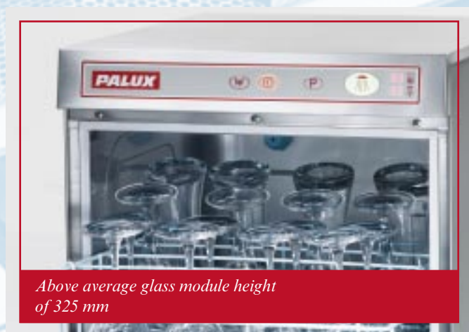
Above average glass module height of 325 mm