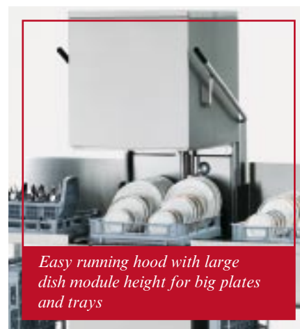
Easy running hood with large dish module height for big plates and trays