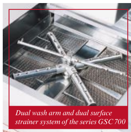
Dual wash arm and dual surface strainer system of the series GSC 700