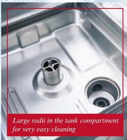
Large radii in the tank compartment for very easy cleaning