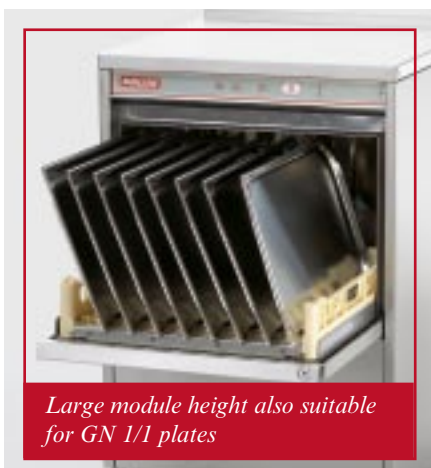
Large module height also suitable for GN 1/1 plates