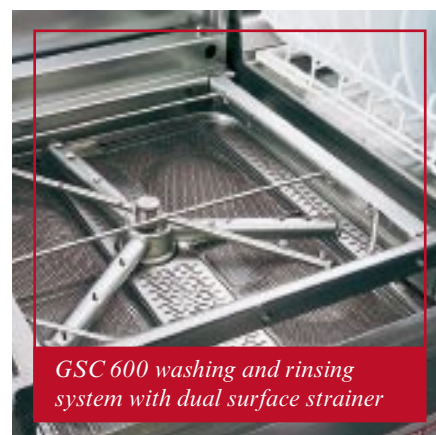
GSC 600 washing and rinsing system with dual surface strainer