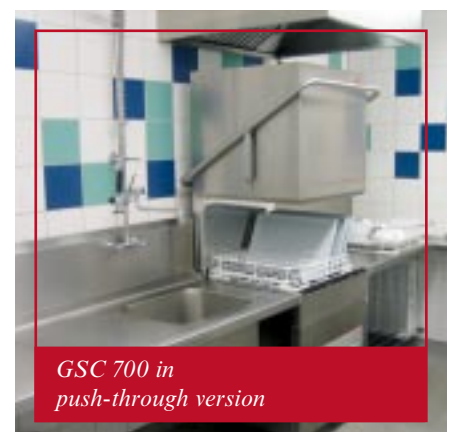
GSC 700 in push-through version