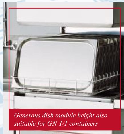
Generous dish module height also suitable for GN 1/1 containers