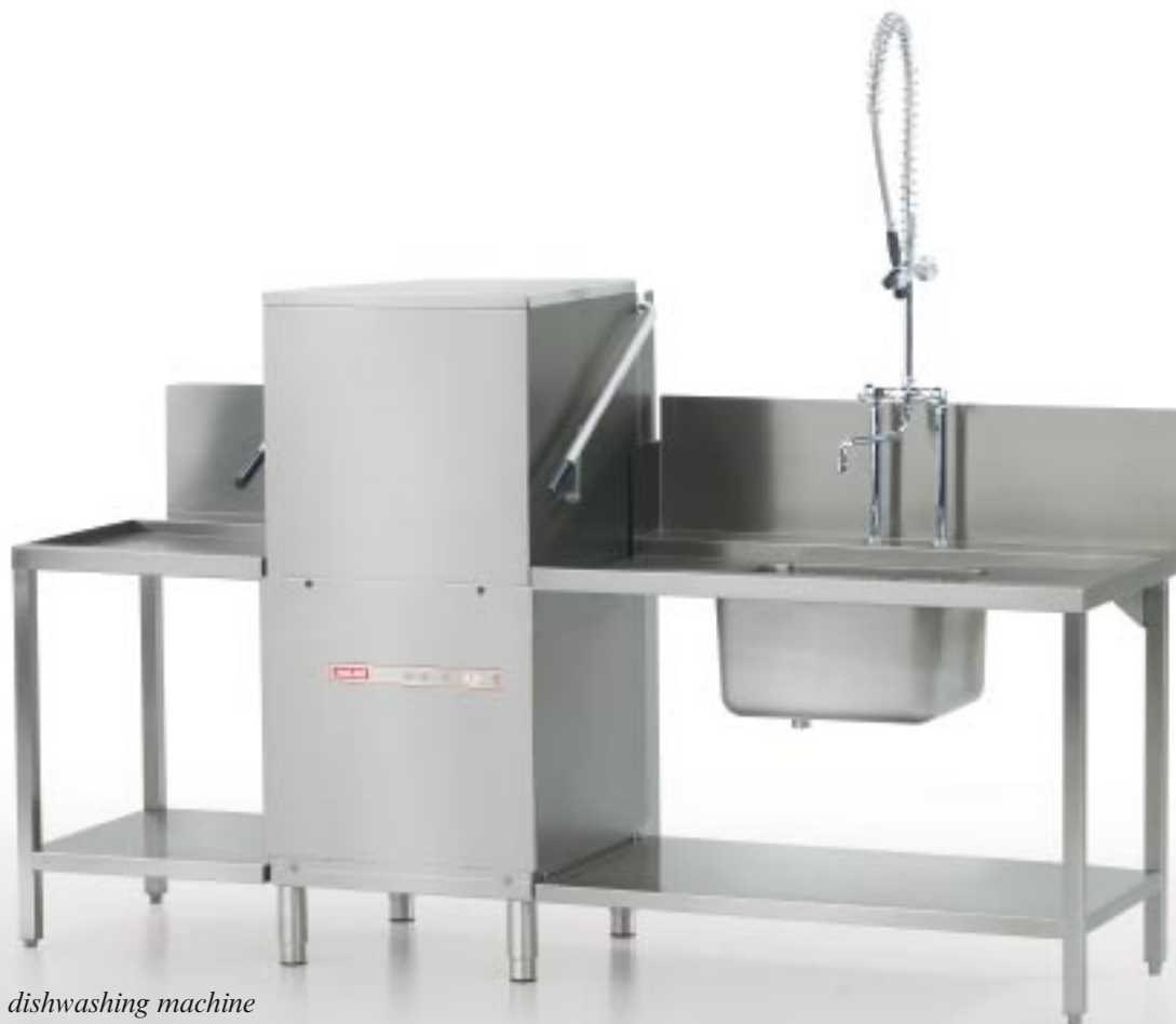
PALUX GSL 500 dishwashing machine in push-through version

The PALUX series GSL 500 dishwashing machines, in push-through or corner version, are particularly recommended as starter models for smaller to medium-sized catering establishments.