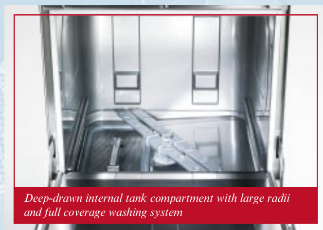
Deep-drawn internal tank compartment with large radii and full coverage washing system