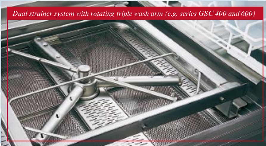
Dual strainer system with rotating triple wash arm (e.g. series GSC 400 and 600)