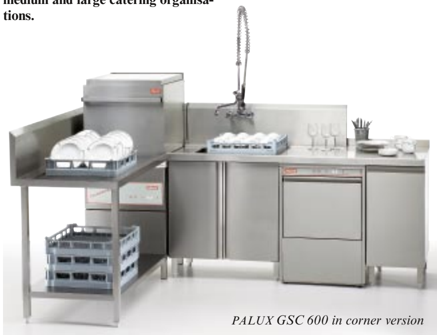
PALUX GSC 600 in corner version