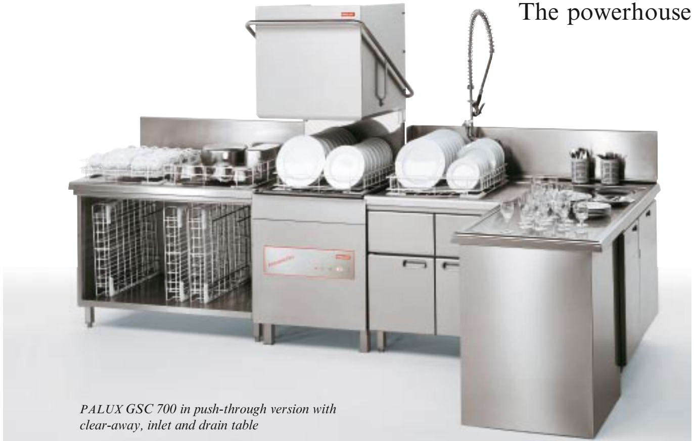
PALUX GSC 700 in push-through version with clear-away, inlet and drain table

The GSC 700 is a washing powerhouse. Anywhere where output and a higher standard are prerequisites and where a superior class of equipment is in demand, the GSC 700, as a push-through or corner model, comes into its own. With an hourly rate of 1200 plates or 1500 cups, it is ideal for the larger catering organisations.