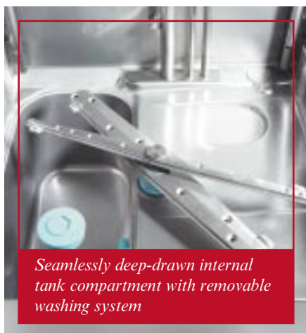
Seamlessly deep-drawn internal tank compartment with removable washing system