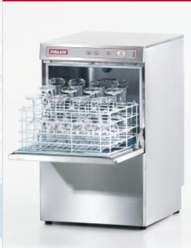
PALUX GL glass washing machine