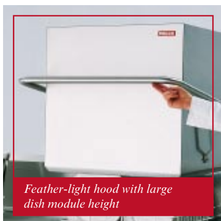
Feather-light hood with large dish module height