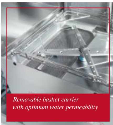
Removable basket carrier with optimum water permeability