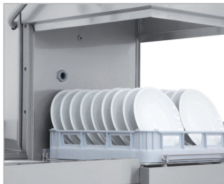
Clear loading height for dishes 465 mm – also suitable for bigger plates