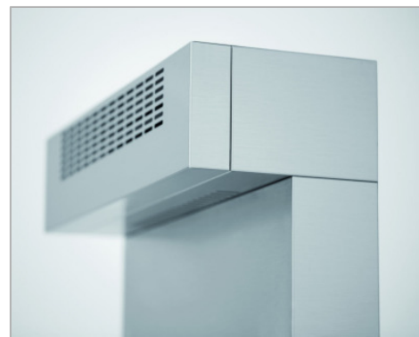
Heat recovery Version GSD 501-TE